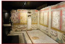
Work Package 4 Decorative Principles of Roman Temples in Italy