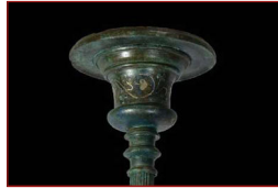
Work Package 2 Imagery and Ornament on Small Finds from the Insula di Menandro (I, 10) at Pompeii