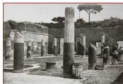
Work Package 6 Insula del Citarista (I, 4) at Pompeii: An Architectural Survey

Contact: hielscher@klassarch.uni-kiel.de