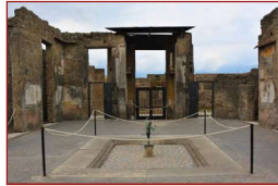
Work Package 1 Decorative Principles in Roman Houses

DECOR , an ERC-funded project based in Department of Classical Archaeology at Christian-Albrechts-Universität zu Kiel, is engaged in a comprehensive analysis of the decorative principles employed in Roman Italy between the Late Republic (early 2nd century BC) and the end of the early Imperial period (late 1st century AD). It is the first research programme of its kind to move away from analyses of single decorative elements in isolation and to focus instead upon their correlation and interaction. This comprehensive approach is being applied to a range of spatial contexts, including houses, sanctuaries and streets, enabling an examination of the changes that decorative principles underwent according various structural and functional characteristics.