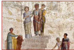
Work Package 3 Insula IX, 5 at Pompeii as a Context of Decorative Systems